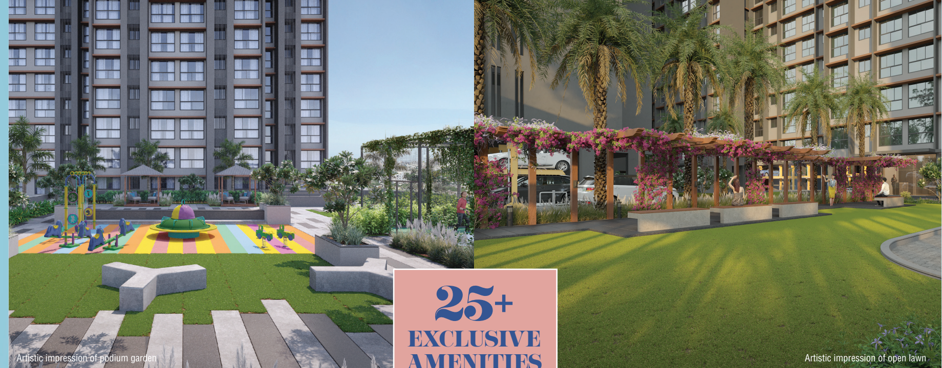
Artistic impression of podium garden